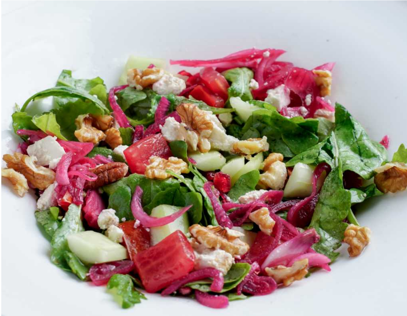
Smoked Feta Salad