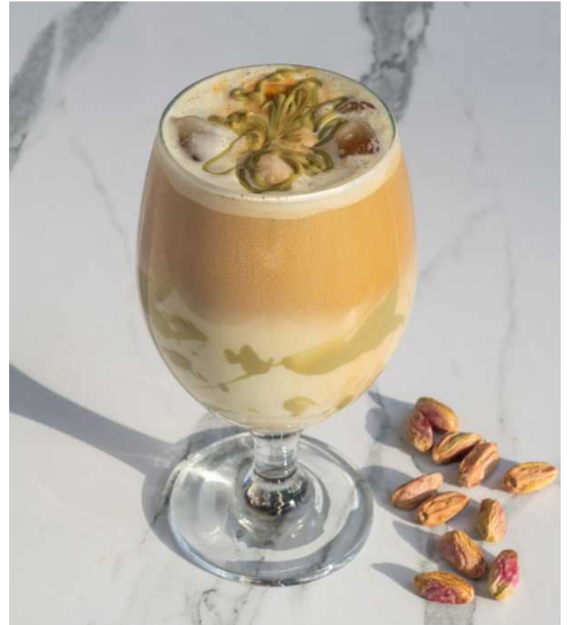
Saffron and Pistachio Lattes