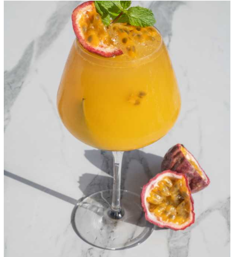
Pomegranate and Passion Fruit Juices