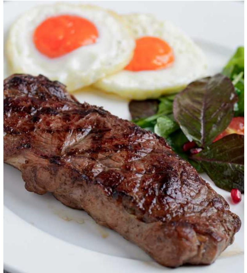
Angus and Wagyu Grade 7 steaks