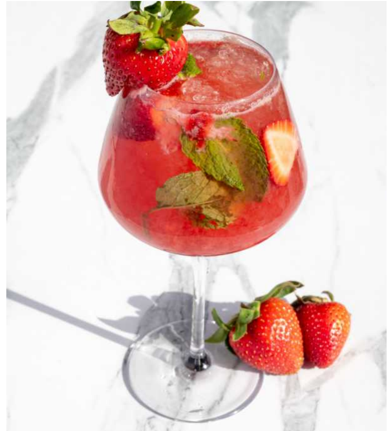
Lime and Strawberry Mojitos