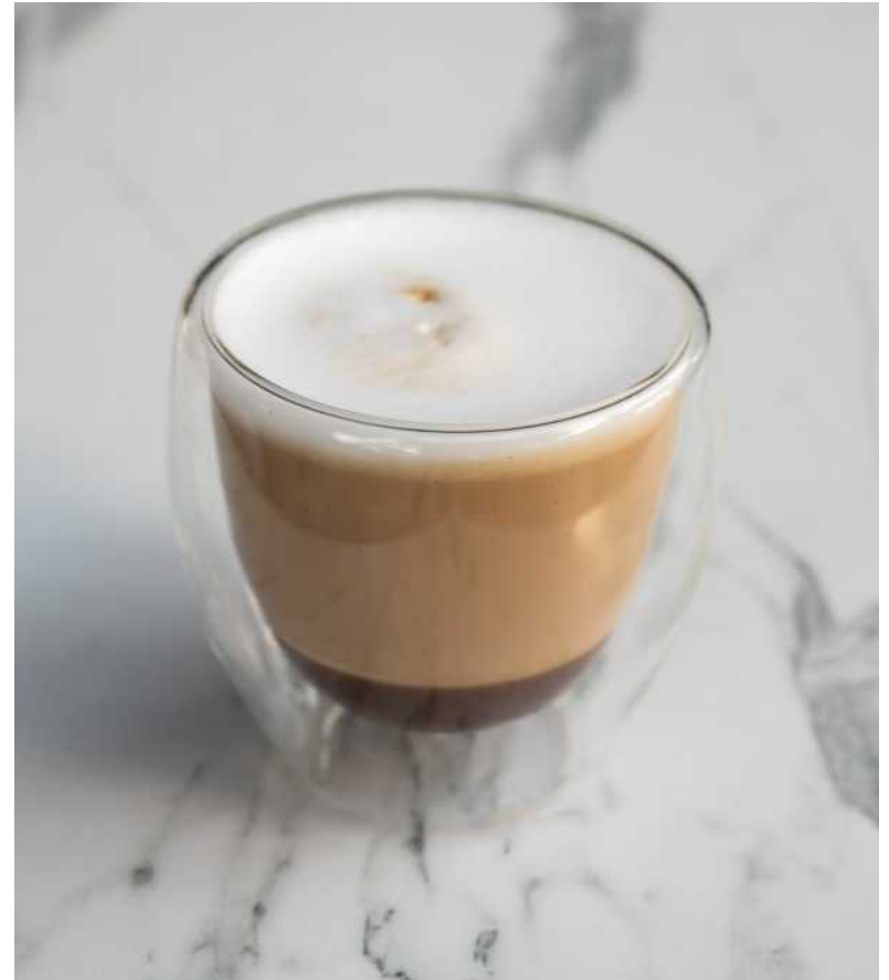
Mango Colada and Macchiato