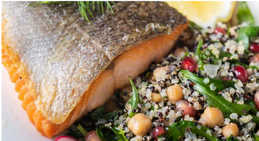
Salmon + Superfoods