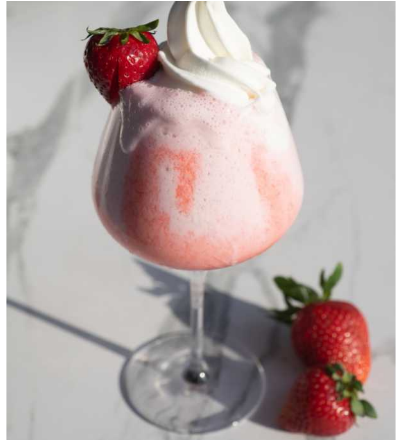
Oreo and Strawberry Milkshakes