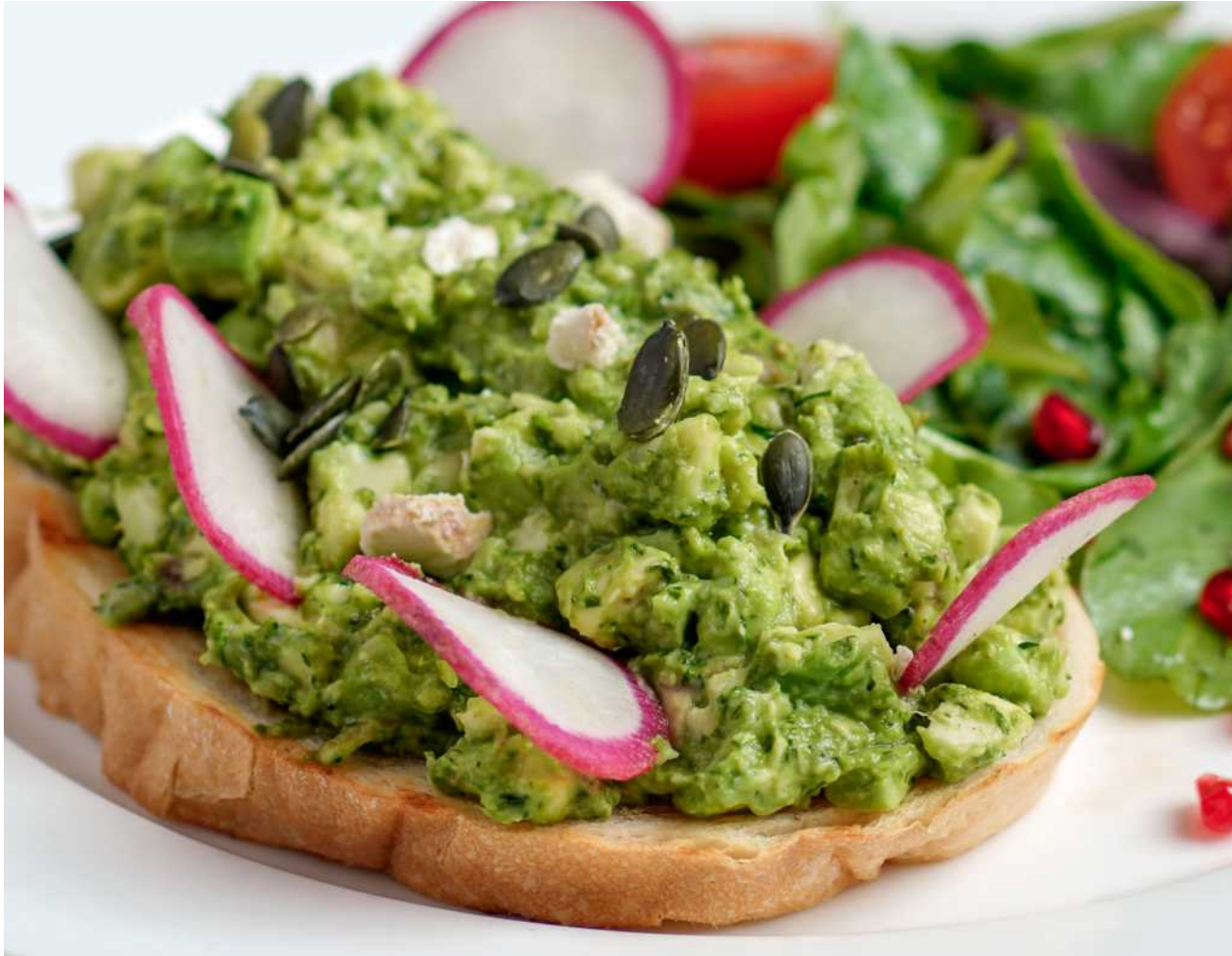
Avo + Toast