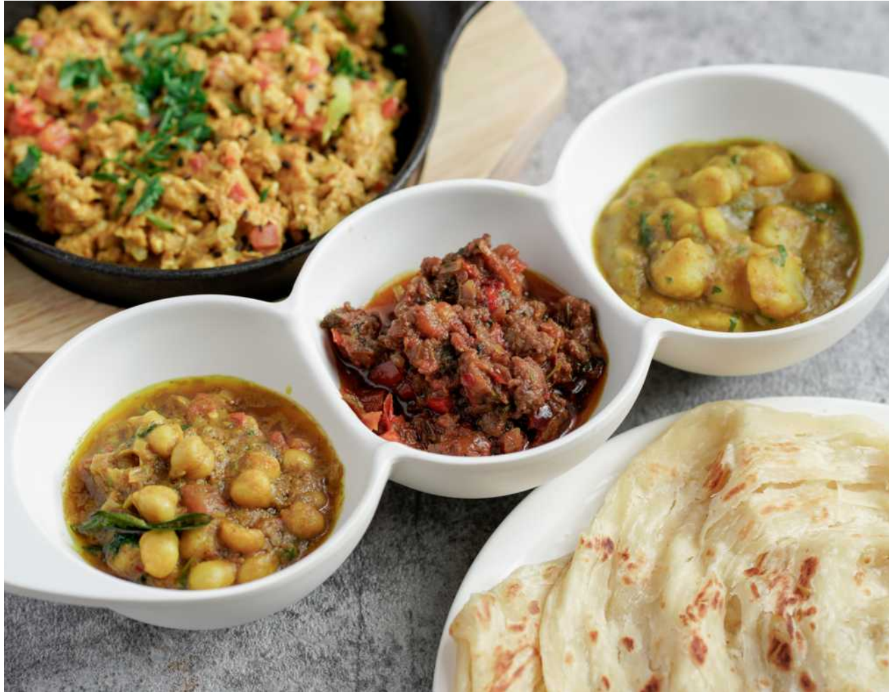
Bombay Builder's Breakfast